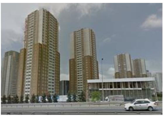
Figure 4. Air photo of Solar Kent