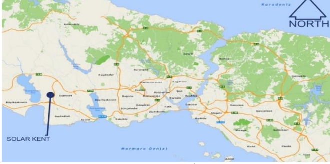
Figure 1.Location of Solar Kent in İstanbul

The project area 2 is located in the earthquake zone. The ground structure is Çukurçeşme Formation (Çf). This formation consists of gravelly sand layers with a thickness of about 25 m, or clay layers or lenses. Çukurçeşme Formation is an important aquifer because it is very porous. But the water he carries is dirty. This unit, which can be considered as a weak middle ground, has developed a type of rotational shear movement due to water retention.